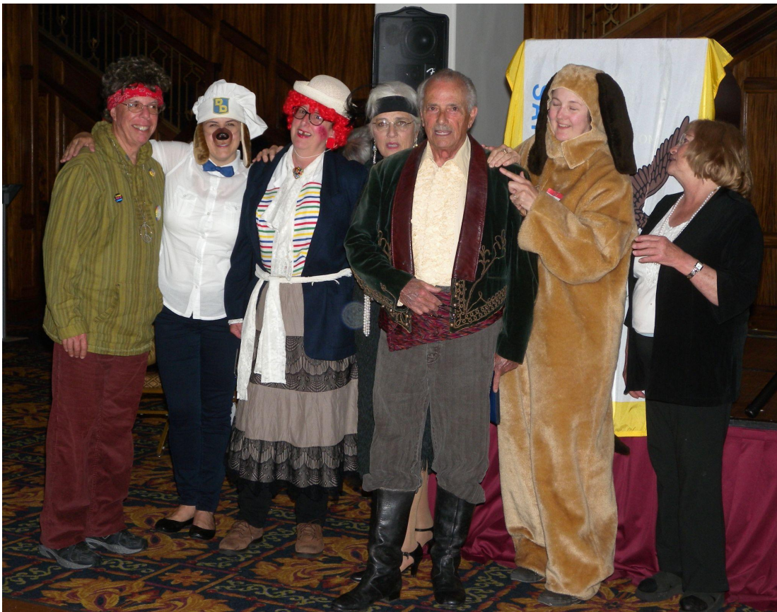
SFHA 30th Anniversary Dinner, 2012