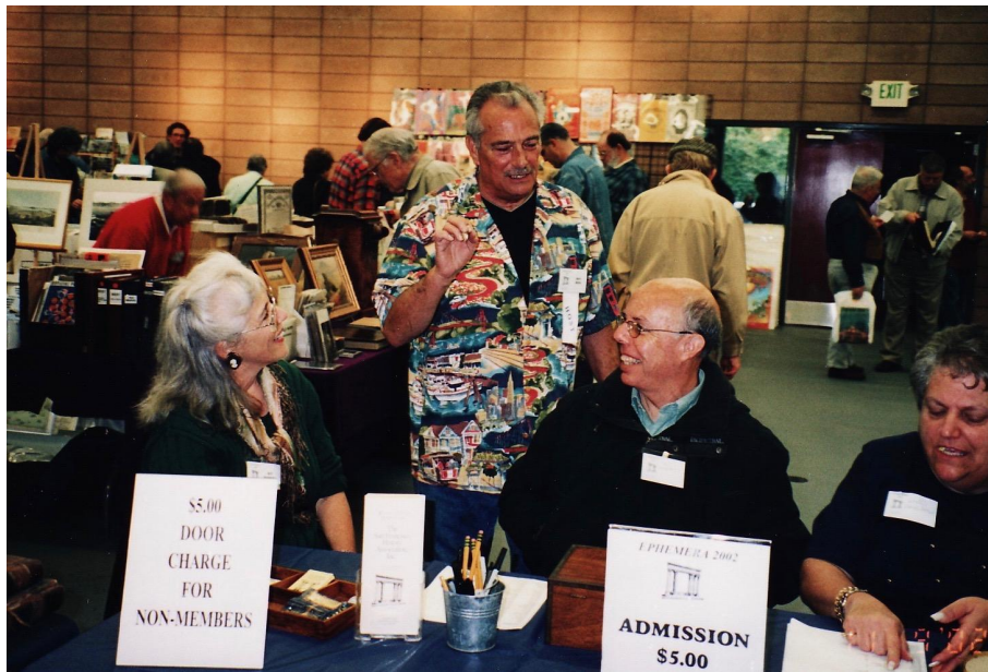
SFHA Ephemera Show - Golden Gate Park, 2002