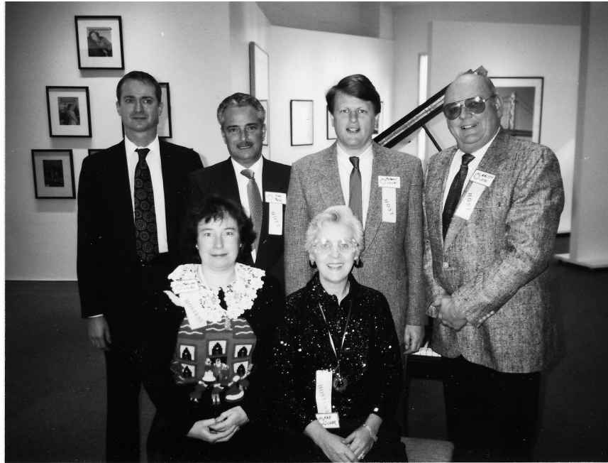
SFHA Board of Directors, 1982