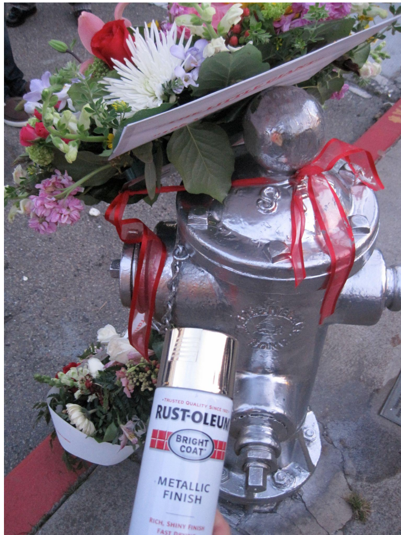
Gold cap silver hydrant - 20th and Church Streets, April 18, 2012