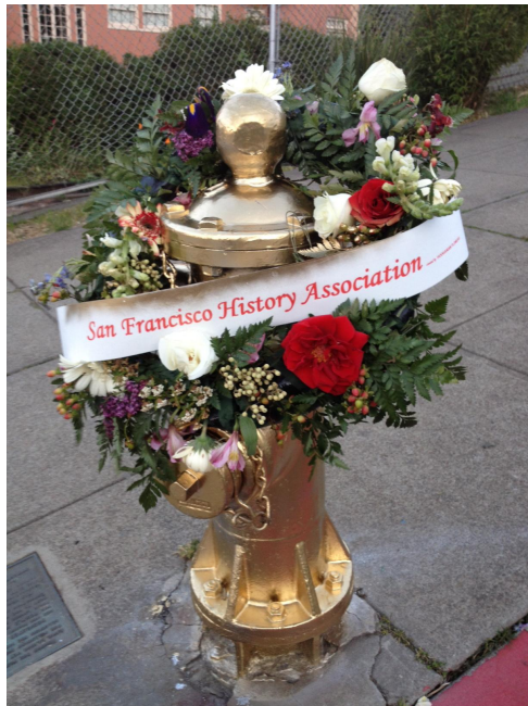
GOLD hydrant, April 18, 2012